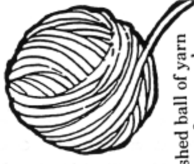
Finished ball of yarn Spun from wool