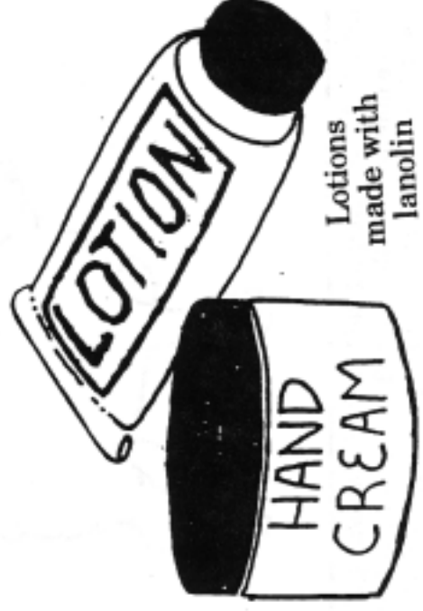
Lotions made with lanolin